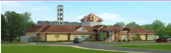
Future St. Leonard Wellness Center projected to open by September 2011